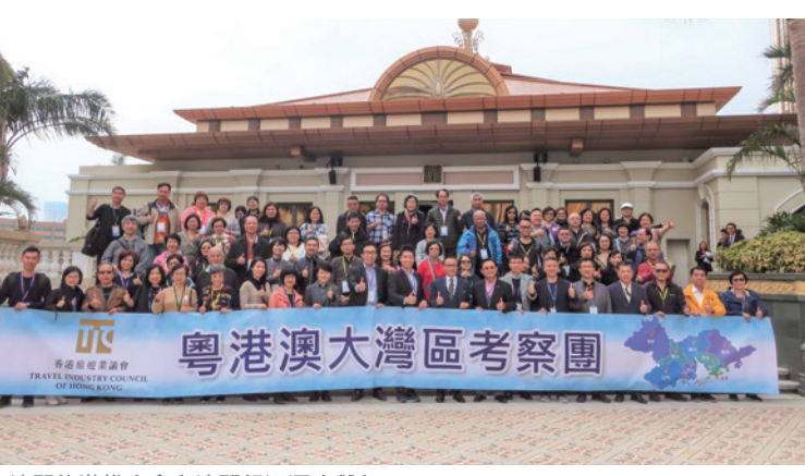
◆澳門旅遊推介會在澳門銀河酒店舉行。 Macao travel promotion seminar at Galaxy Macau.

The three GBA delegations organised between July last year and January this year have enabled over 200 Hong Kong traders to inspect various tourist attractions in the GBA and foster ties with their counterparts in the other 10 GBA cities.